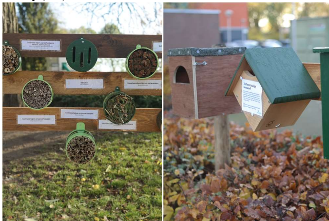
Figure 1 - Two of the local artifacts working with augmented reality. To the left figure 1.1 and to the right figure 1.2

The first encounter with Buur Natuur is probably at one of the locally placed artifacts. They offer inspiration by presenting examples and information about what could be done. Furthermore, they direct to the online platform, for example via Augmented Reality (AR).