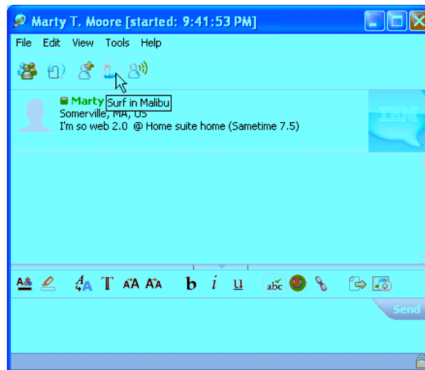
Figure 3. “Surf in Malibu” action integrated in the chat window.

Sametime 7.5 chat window (see Figure 3) that allows users to trigger a “Surf in Malibu” action on their buddies. This also submits a search request to the publish / subscribe bus and Malibu extensions can perform a similar search on the buddy’s identity, showing items related to the searched person. Future versions of Malibu may make use of tags that have been associated with users, e.g., through an enhanced directory service that allows one user to write tags to characterize another user (Farrell and Lau, 2006).