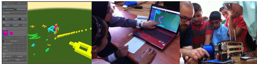
Figure 2. CubeTeam (l), 3D modeling (m) and printing (r) in Palestine.

notes and memos between the field researchers, interspersed by occasional Skype calls with senior researchers at home to ensure inter-coder reliability. The analysis was then finalized at home together with researchers not involved in the field work. Furthermore, the 3D printing infrastructure was left in Palestine to remotely study the more long-term appropriation and projects. This paper draws on both our fieldwork as well as the remote observations conducted from Siegen.