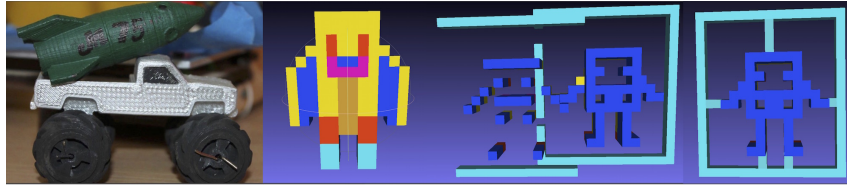
Figure 4. Rocket on a truck (l), Spongebob variations (r)..