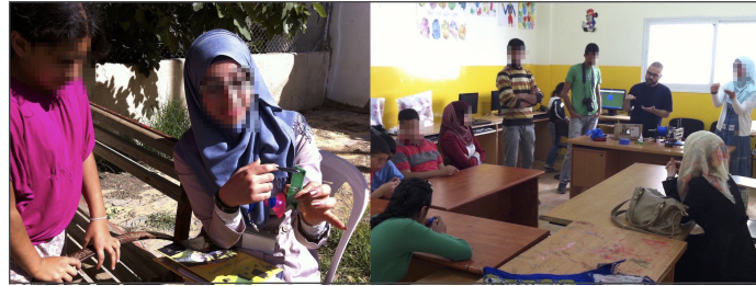
Figure 1. Come_IN sessions in Palestine.