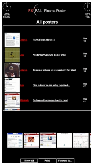
Figure 4: Scrollable content overviews by person, by posting date and by content help readers at the Plasma Posters browse posted content

(iii) active browsing and searching People remove physical postings to see what lies beneath. When they have noticed something previously, they sometimes come back to explicitly look for it. On the Plasma Posters, buttons are available for manually moving forward and backward through upcoming and previously displayed content. Browsing and navigating all items in the current list of postings is possible using with the overviews (Figure 4).