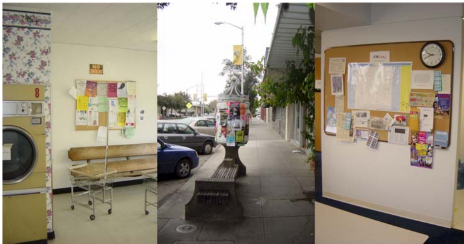
Figure 1: Community boards: in the laundrette; on the street; in the workplace

The intent behind the Plasma Posters is to stimulate unplanned social interactions around digital content and thus provide opportunities for discovery of shared interests. Such conversations are central in establishing and strengthening social ties (Granovetter, 1983). This work sits within the same design space as research carried by Houde et al. (1998) who projected a digital newsletter created by members of a research group into a common gathering space, and Snowdon and Grasso (2001) who describe the “Community Wall” (CWall), a community bulletin board that displays community rated research papers and news in public spaces.