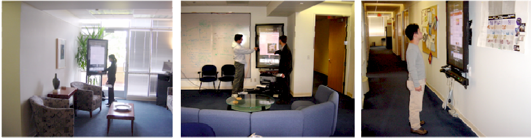
Figure 2: Plasma Posters are located in a corridor (left), a foyer (middle) and the kitchen (right)

been iteratively designed over the last year to suit the needs of our local community members, then offer a brief overview of the underlying infrastructure.