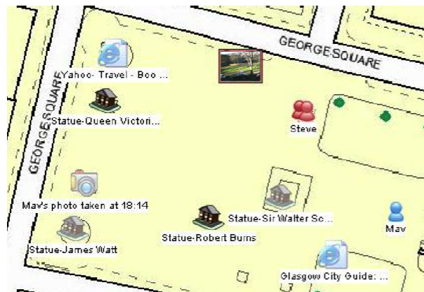
Figure 2. A screenshot of the map showing recommended places, photos and webpages. One's own recommendations shown in full colour while one's co-visitor's are shown 'ghosted'.

One example of an informative use of the map involved an early trial participant browsing the 'Wikipedia' pages about William Gladstone—pages that were then recommended to later trial participants who went to that statue. The recommended web pages were positioned on the map and acted as geographically specific web bookmarks taken from others' past behaviour. These recommendations proved particularly useful to the outdoor visitors, since they could view these recommended web pages by clicking on them, without having to navigate the web. In addition, due to the collaborative filtering algorithm, statues in the square visited frequently by users were recommended more often than others.